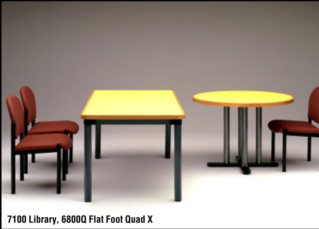
7100 Library, 6800Q Flat Foot Quad X