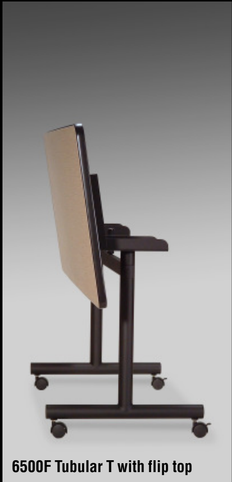
6500F Tubular T with flip top

Group Four Furniture Inc. Oakville, Ontario tel: (877) 585-1478 tel: (905) 845-0211 fax: (905) 845-6894 email: g4furn@aol.com www.groupfourfurniture.com