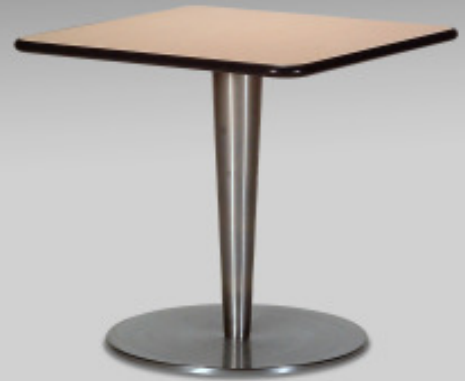
6200C Disc with tapered column