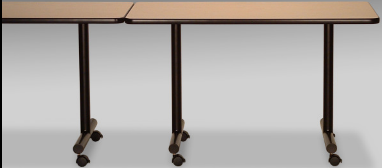
6500 Tubular T with twin-wheel casters