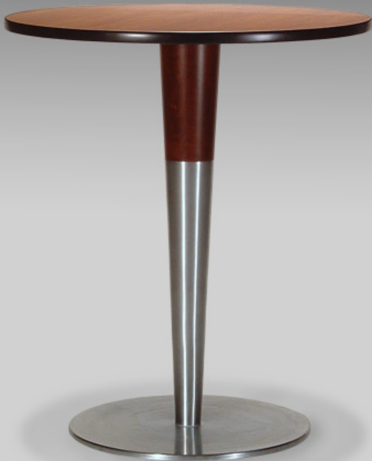
6200C Disc base with tapered column