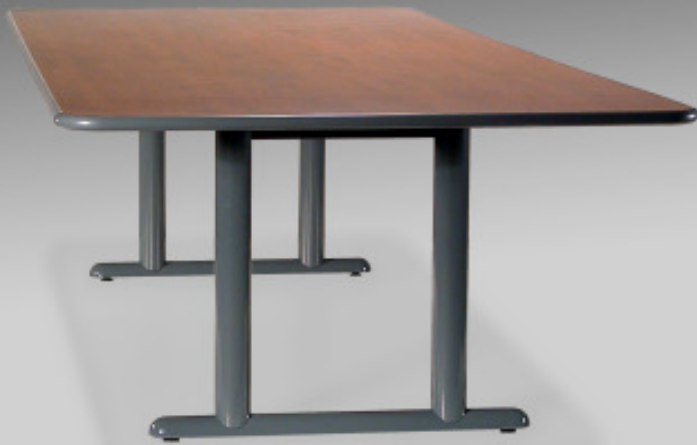
6300DC Half Round double column